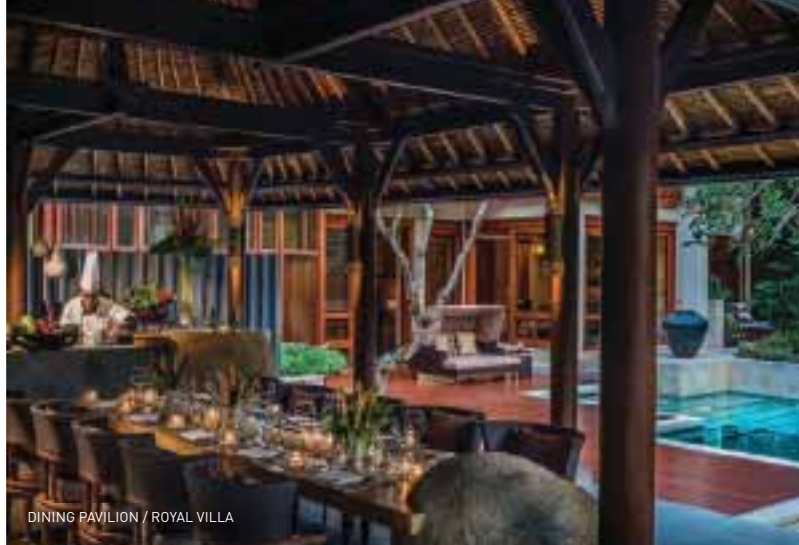
DINING PAVILION / ROYAL VILLA