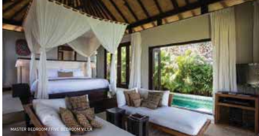
MASTER BEDROOM / FIVE BEDROOM VILLA