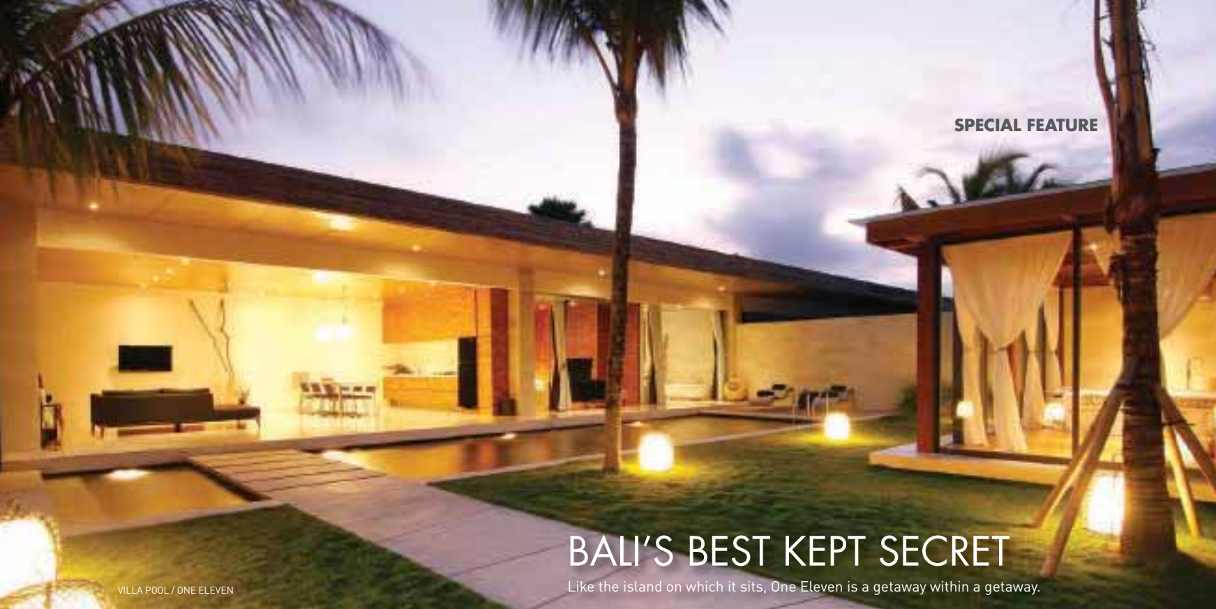
VILLA POOL / ONE ELEVEN