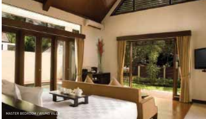
MASTER BEDROOM / AYUNG VILLA