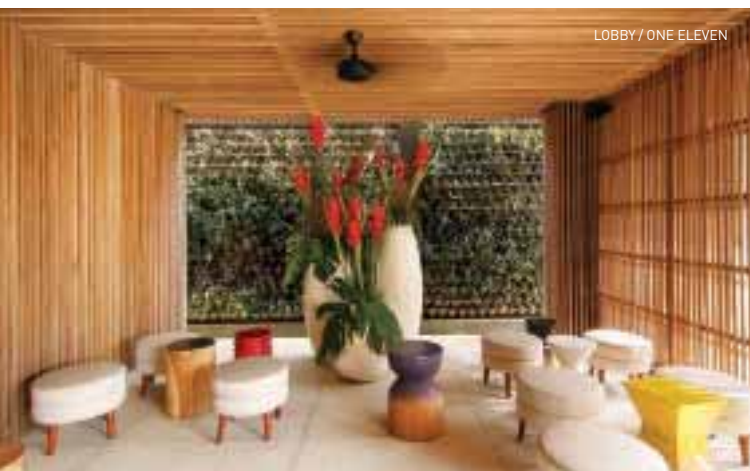
LOBBY / ONE ELEVEN