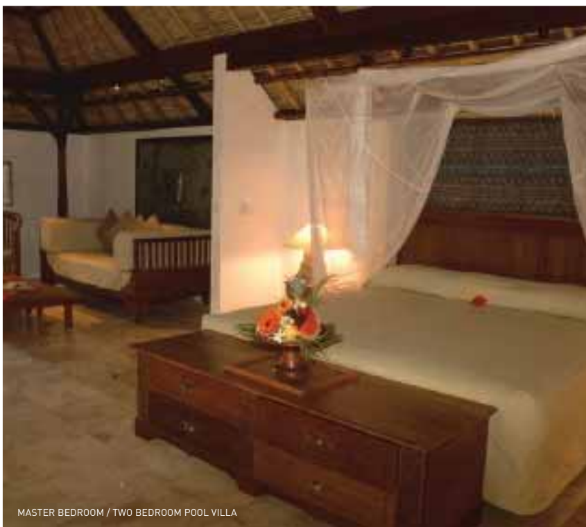
MASTER BEDROOM / TWO BEDROOM POOL VILLA