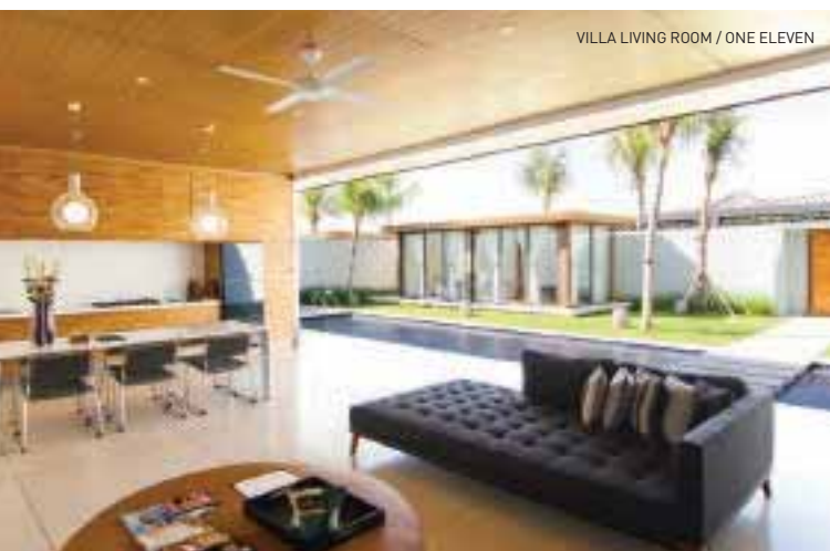
VILLA LIVING ROOM / ONE ELEVEN

Hidden amidst a million-pot garden in the heart of bustling Seminyak, One Eleven is secluded but convenient, private yet unpretentious, offering the best of Bali's contrasting worlds in just over 50,000 square feet. Packed with nine stunning villas, a tranquil spa, and a bespoke sushi and sake bar, this chic compound is an escape from more than just a day-to-day routine, but the entire world beyond its walls.