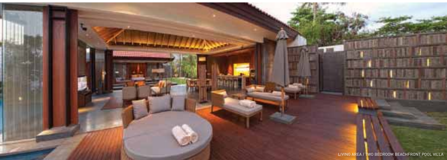
LIVING AREA / TWO BEDROOM BEACHFRONT POOL VILLA