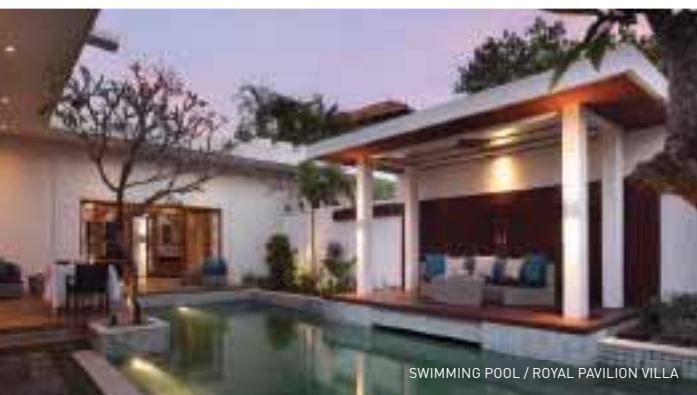
SWIMMING POOL / ROYAL PAVILION VILLA