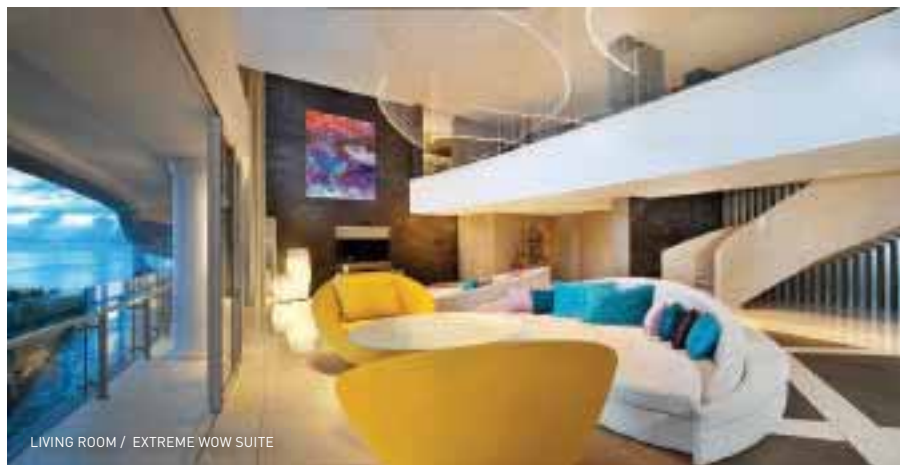
LIVING ROOM / EXTREME WOW SUITE