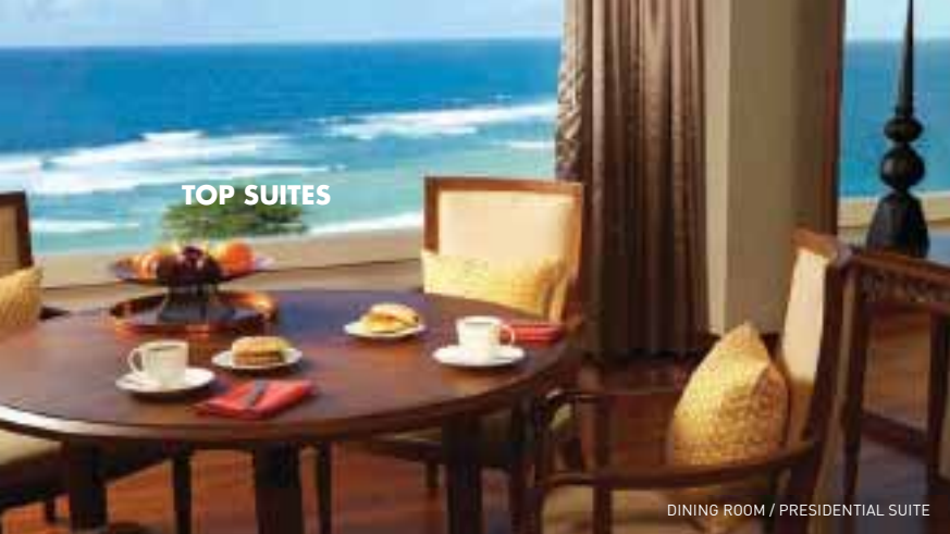
DINING ROOM / PRESIDENTIAL SUITE