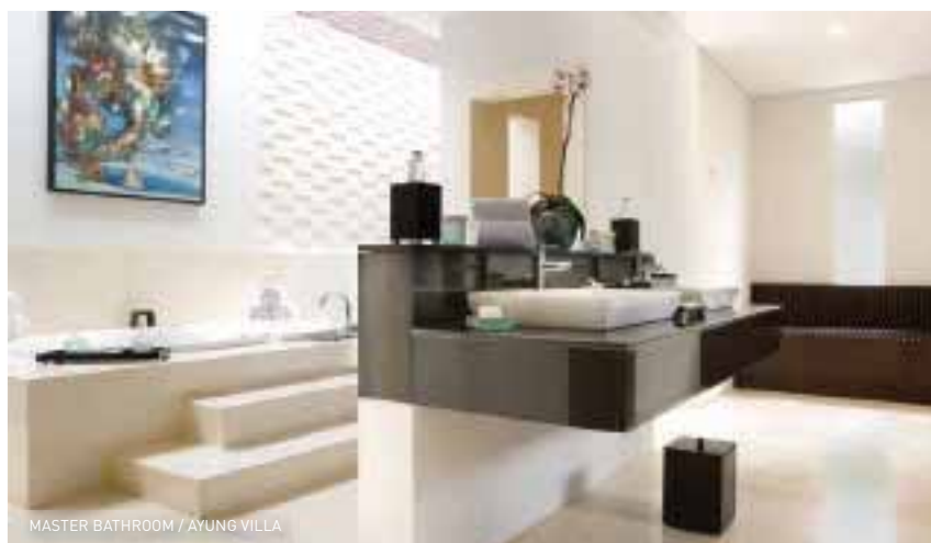
MASTER BATHROOM / AYUNG VILLA