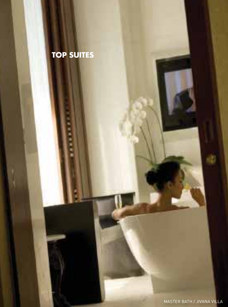
MASTER BATH / JIVANA VILLA