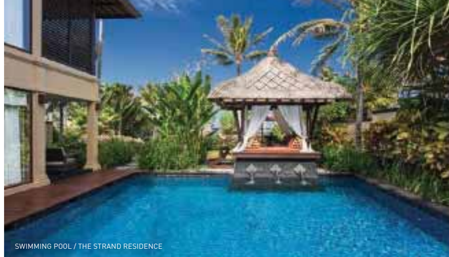
SWIMMING POOL / THE STRAND RESIDENCE