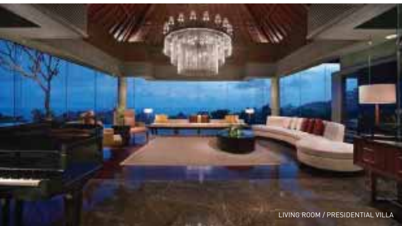
LIVING ROOM / PRESIDENTIAL VILLA