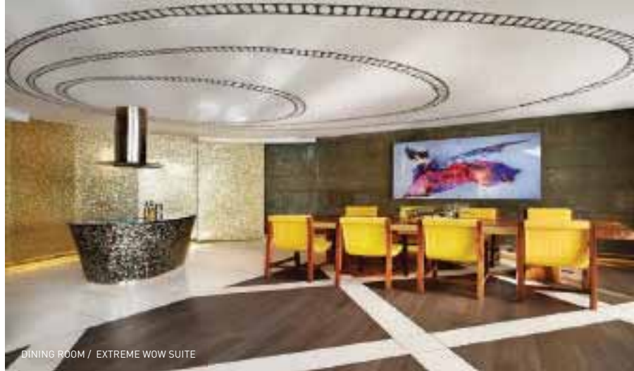
DINING ROOM / EXTREME WOW SUITE