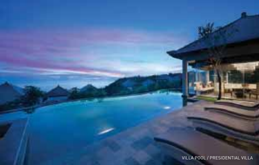
VILLA POOL / PRESIDENTIAL VILLA