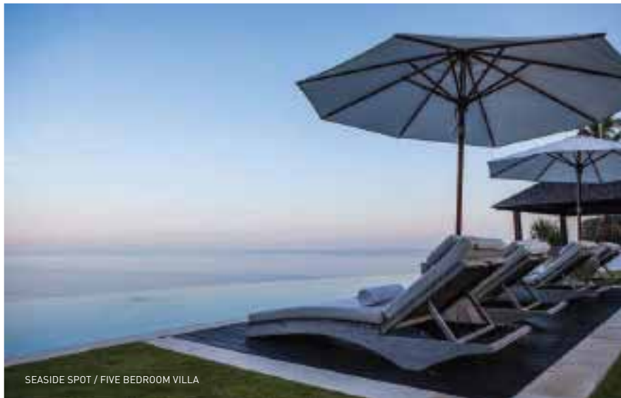
SEASIDE SPOT / FIVE BEDROOM VILLA