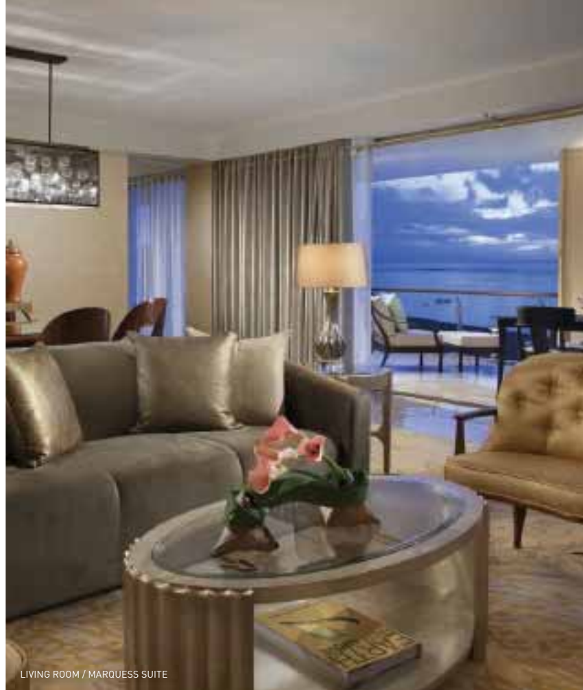
LIVING ROOM / MARQUESS SUITE