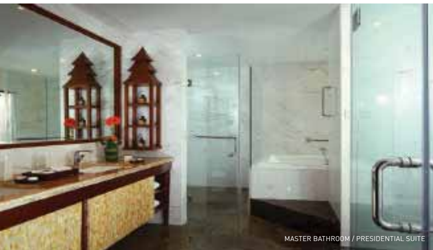
MASTER BATHROOM / PRESIDENTIAL SUITE