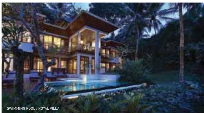
SWIMMING POOL / ROYAL VILLA