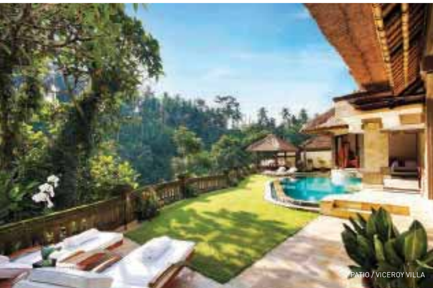
PATIO / VICEROY VILLA