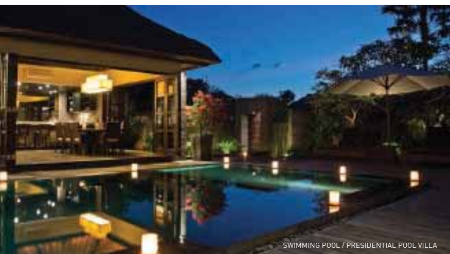
SWIMMING POOL / PRESIDENTIAL POOL VILLA