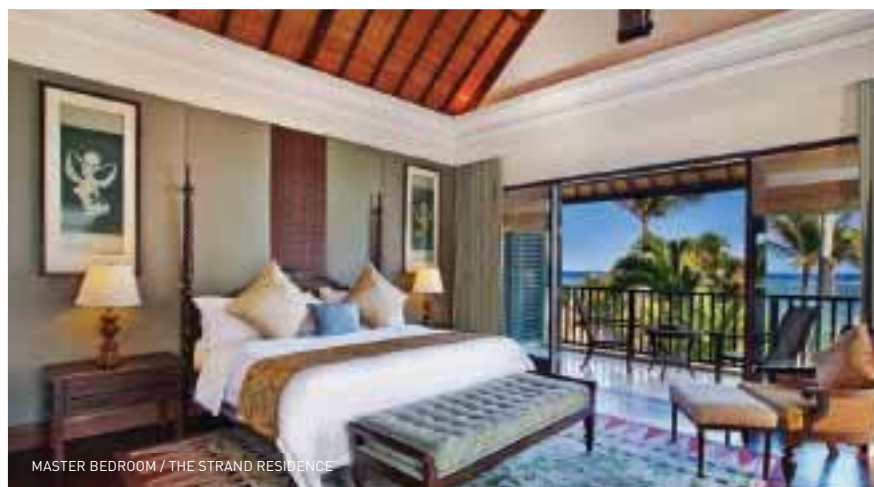
MASTER BEDROOM / THE STRAND RESIDENCE