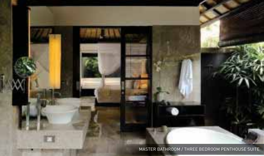
MASTER BATHROOM / THREE BEDROOM PENTHOUSE SUITE