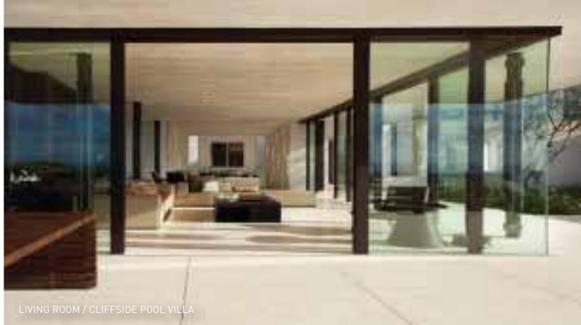
LIVING ROOM / CLIFFSIDE POOL VILLA